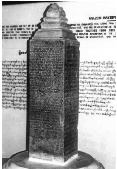
Figure 1 : Myazedi Stone Inscription

Myazedi stone inscription, now displayed in Bagan Museum, discovered in 1886–87 by a German Pali scholar and Superintendent of the Epigraphic Office, Dr. Forchhammer, is dated 1113 A.D or 474 Myanmar Era. Myazedi stone inscription was discovered near Myazedi Pagoda at Myinkaba village the south of ancient Bagan (now, Bagan, Nyaung Oo Township, Mandalay Division). Another one discovered in the Ku Byauk Kyi Temple is now set up on the platform of Myazedi Pagoda. These two inscriptions are identical except the one display at the Bagan Museum is a square pillar of sandstone and the other on the platform of Myazedi Pagoda is rectangular. The Myazedi inscribed